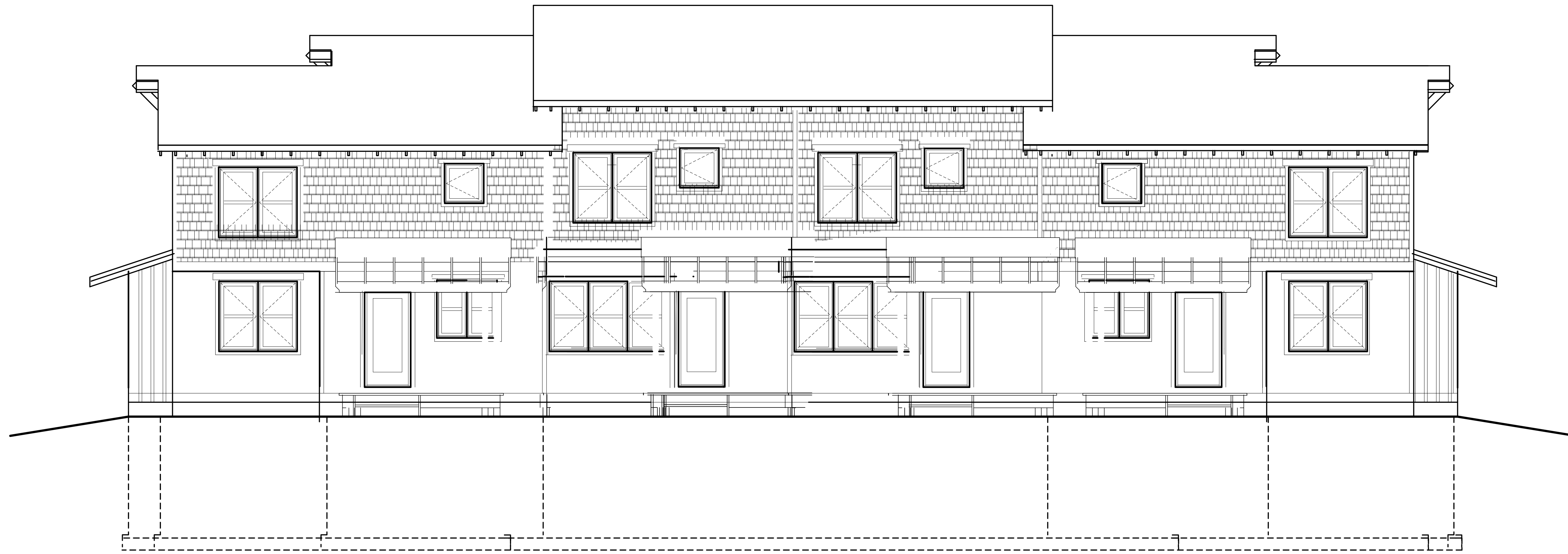
FRONT ELEVATION DBBD UNITS